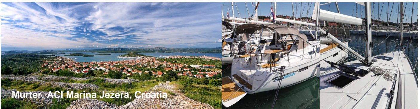
Murter, ACI Marina Jezera, Croatia