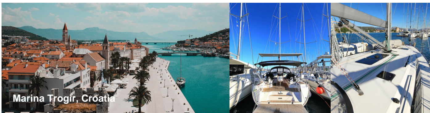
Marina Trogir, Croatia