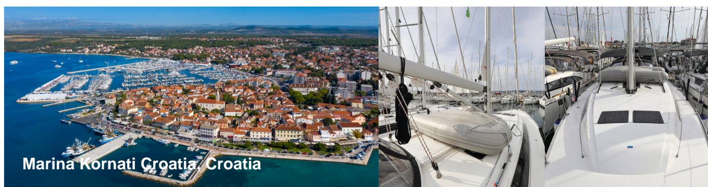
Marina Kornati Croatia, Croatia