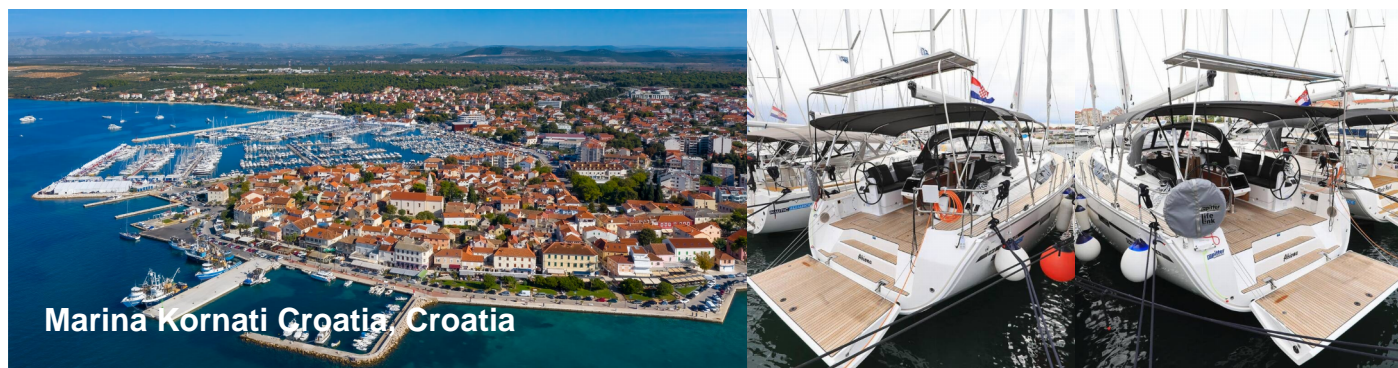
Marina Kornati Croatia Croatia