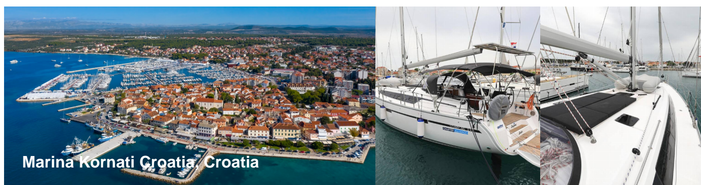
Marina Kornati Croatia Croatia