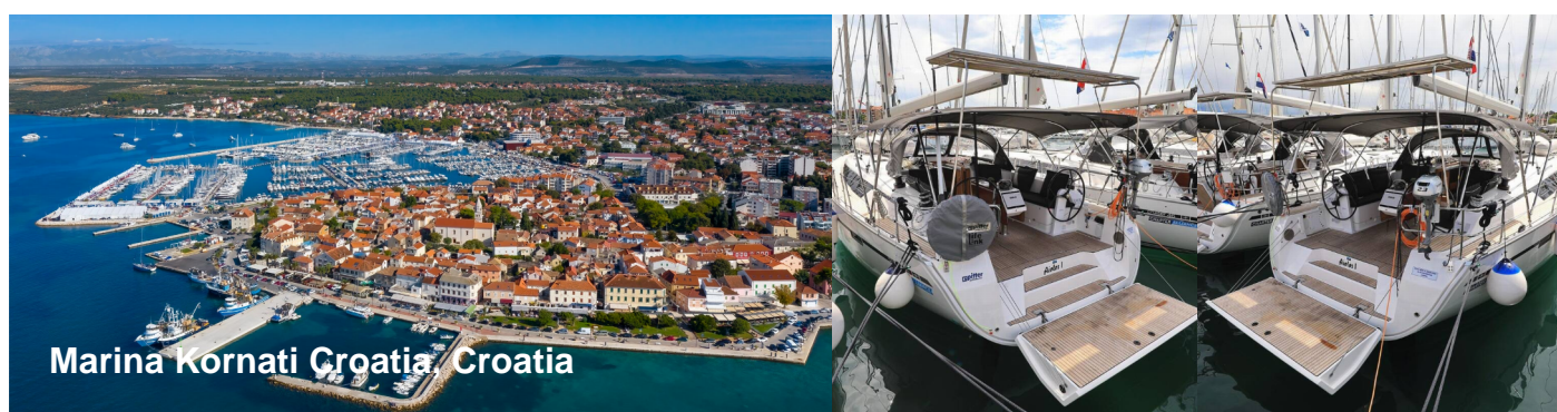
Marina Kornati Croatia Croatia