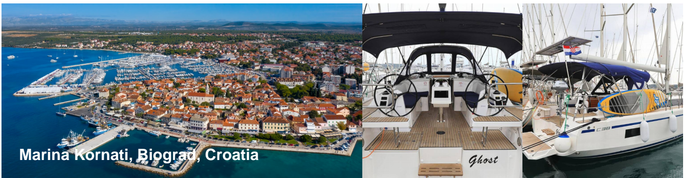
Marina Kornati, Biograd, Croatia