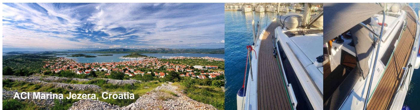
ACI Marina Jezera, Croatia