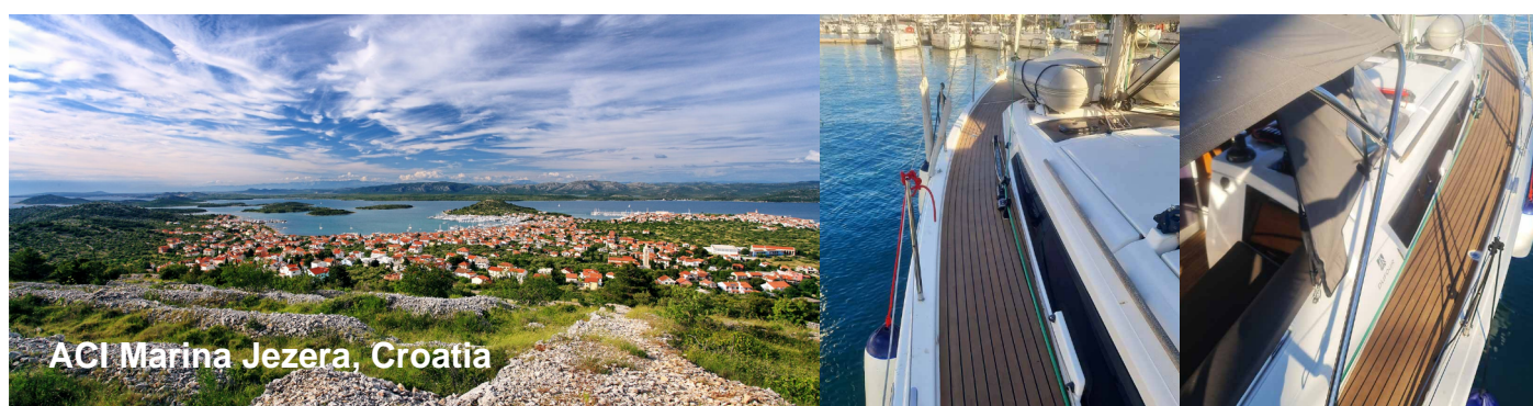
ACI Marina Jezera, Croatia