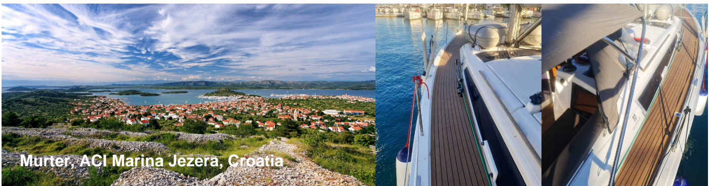
Murter, ACI Marina Jezera, Croatia