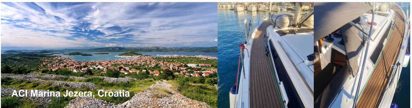
ACI Marina Jezera, Croatia