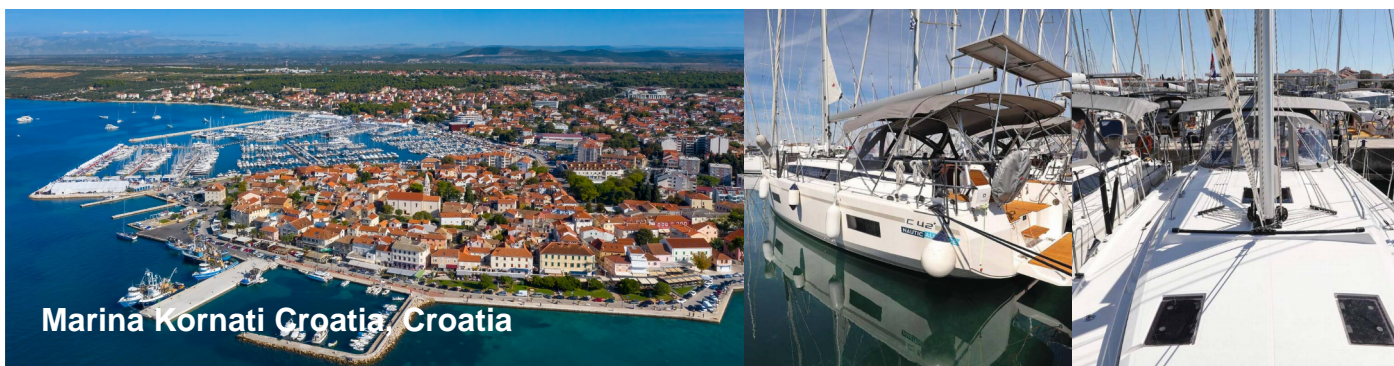
Marina Kornati Croatia Croatia