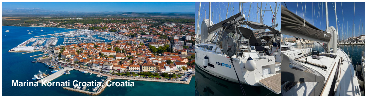
Marina Kornati Croatia Croatia