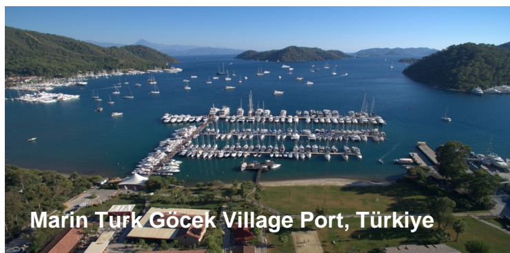
Marın Türk Göcek Village Port, Türkiye