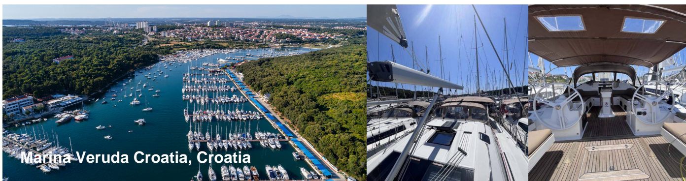
Marina Veruda Croatia, Croatia