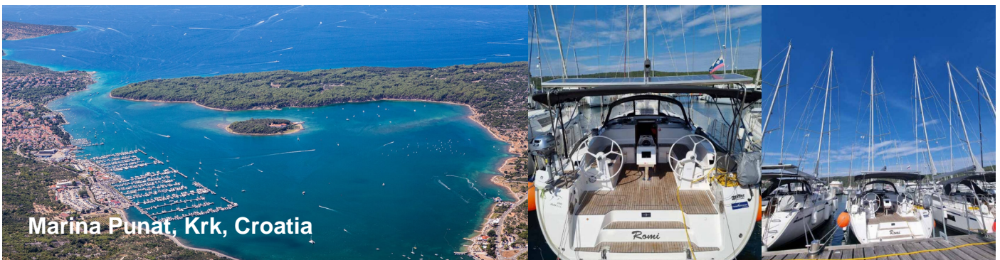
Marina Punat, Krk, Croatia