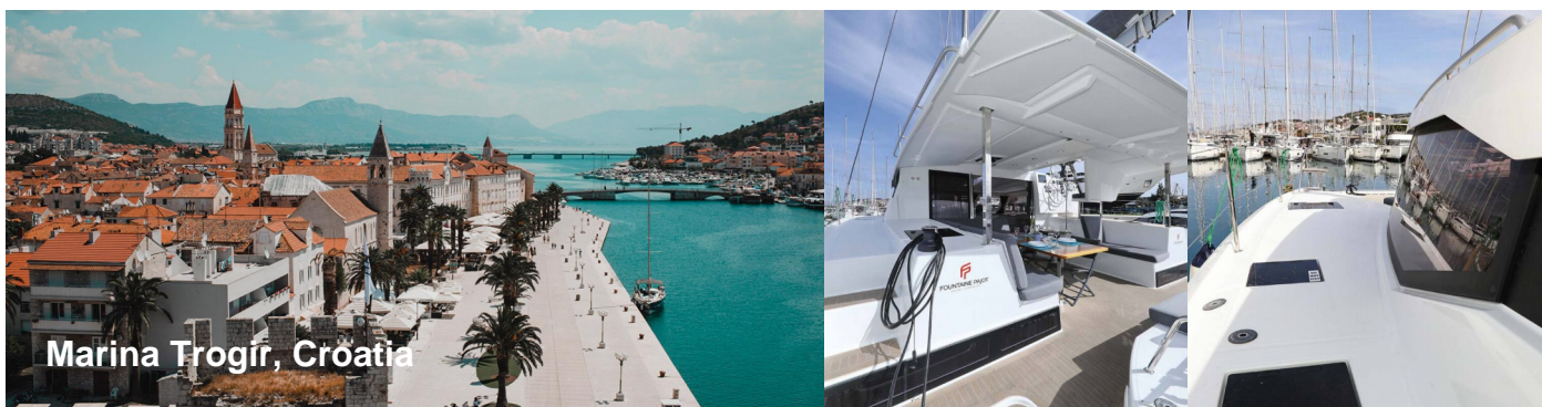
Marina Trogir, Croatia