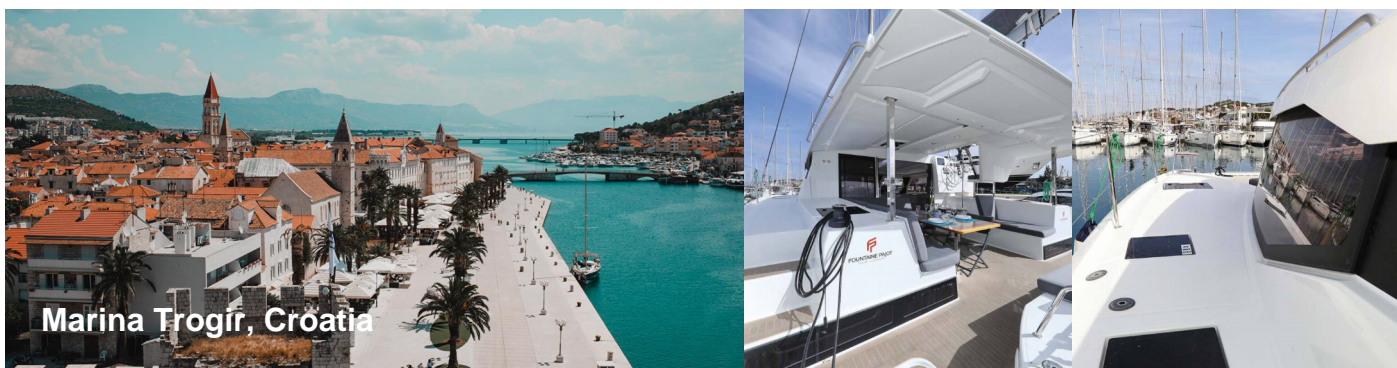
Marina Trogir, Croatia