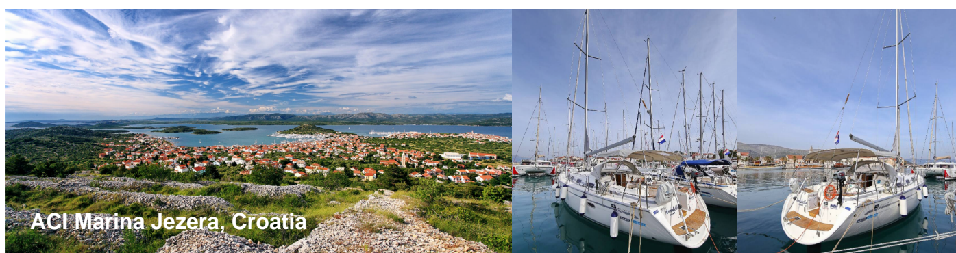
ACI Marina Jezera, Croatia