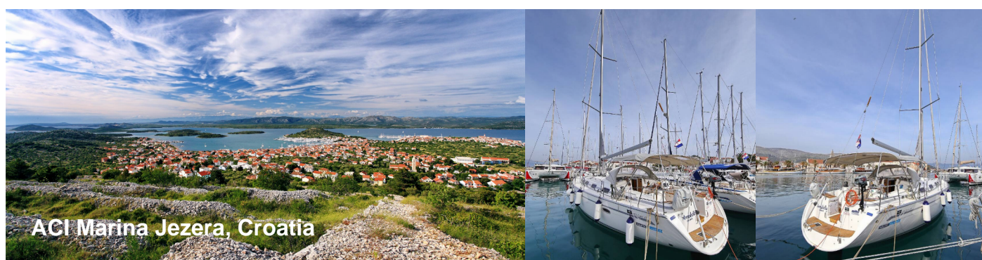
ACI Marina Jezera, Croatia