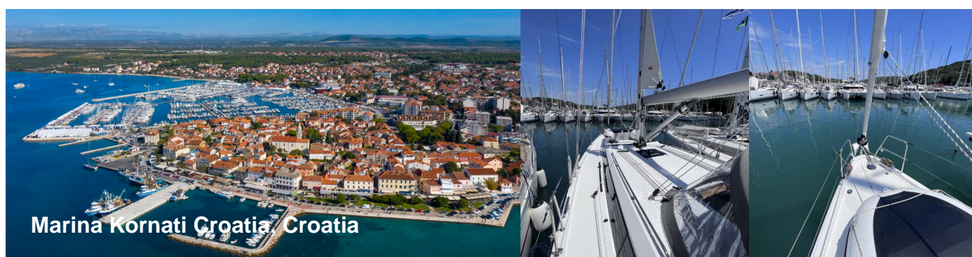
Marina Kornati Croatia, Croatia