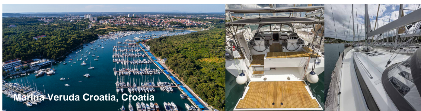
Marina Veruda Croatia, Croatia