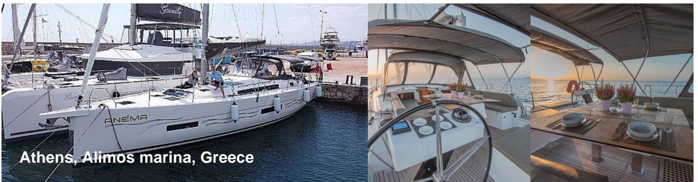
Athens, Alimos marina, Greece