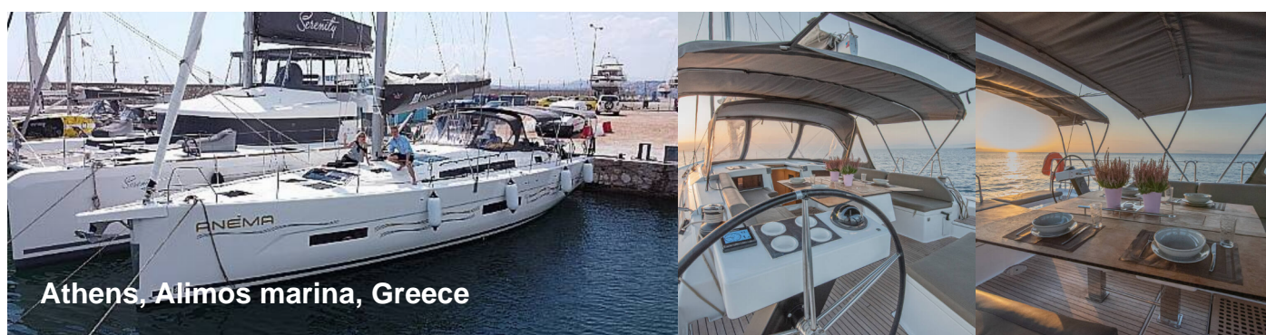
Athens, Alimos marina, Greece