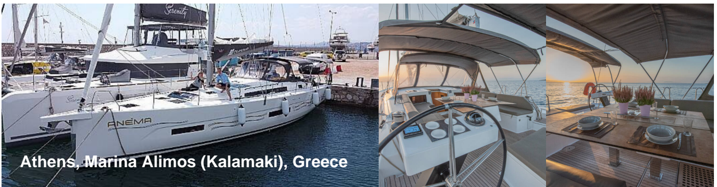
Athens, Marina Alimos (Kalamaki), Greece