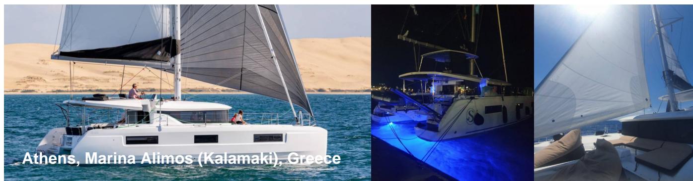
Athens, Marina Alimos (Kalamaki), Greece