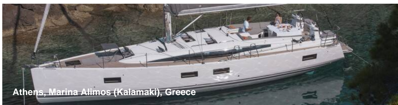
Athens, Marina Alimos (Kalamaki), Greece