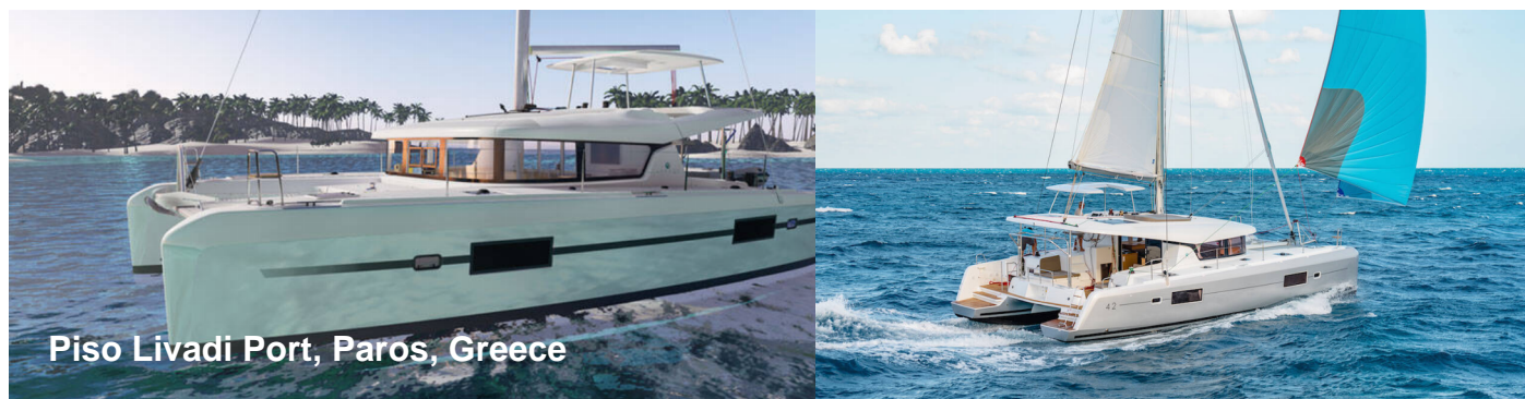
Piso Livadi Port, Paros, Greece