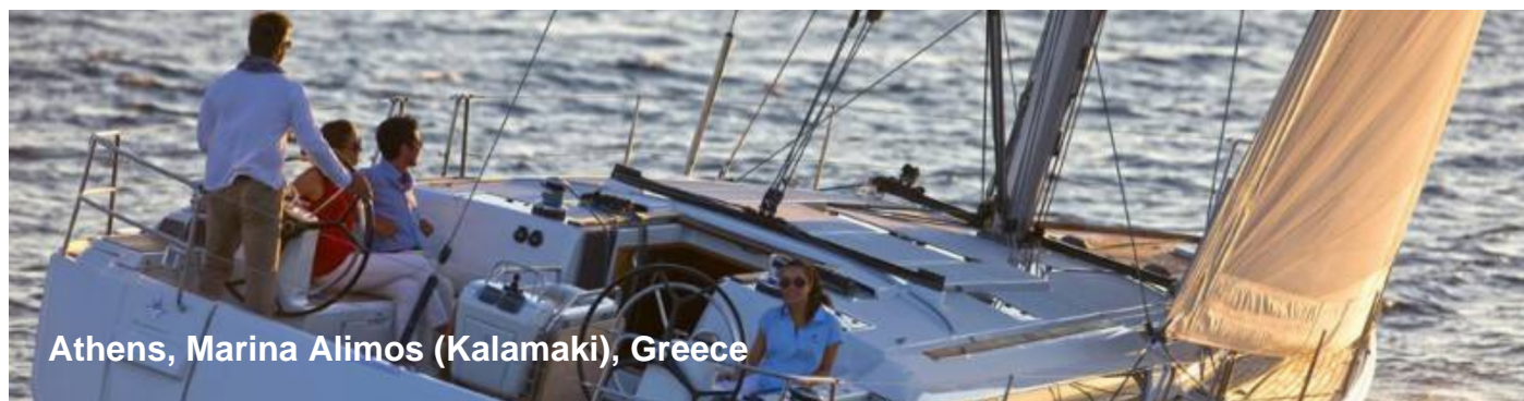
Athens, Marina Alimos (Kalamaki), Greece