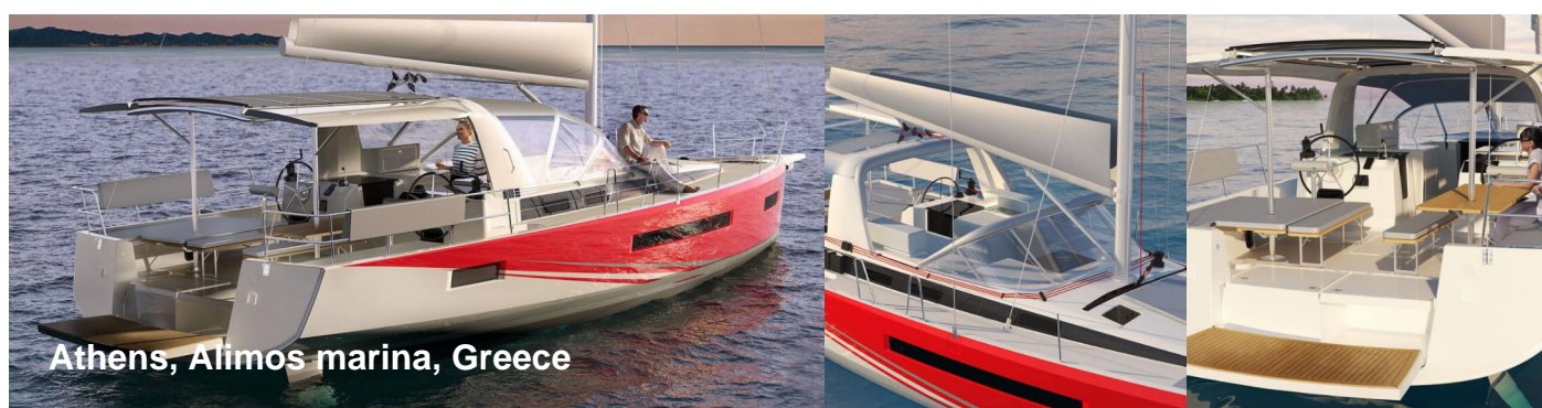
Athens, Alimos marina, Greece