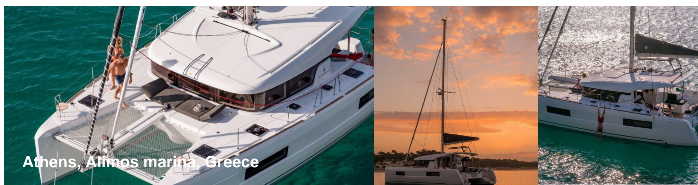
Athens, Alimos marina, Greece