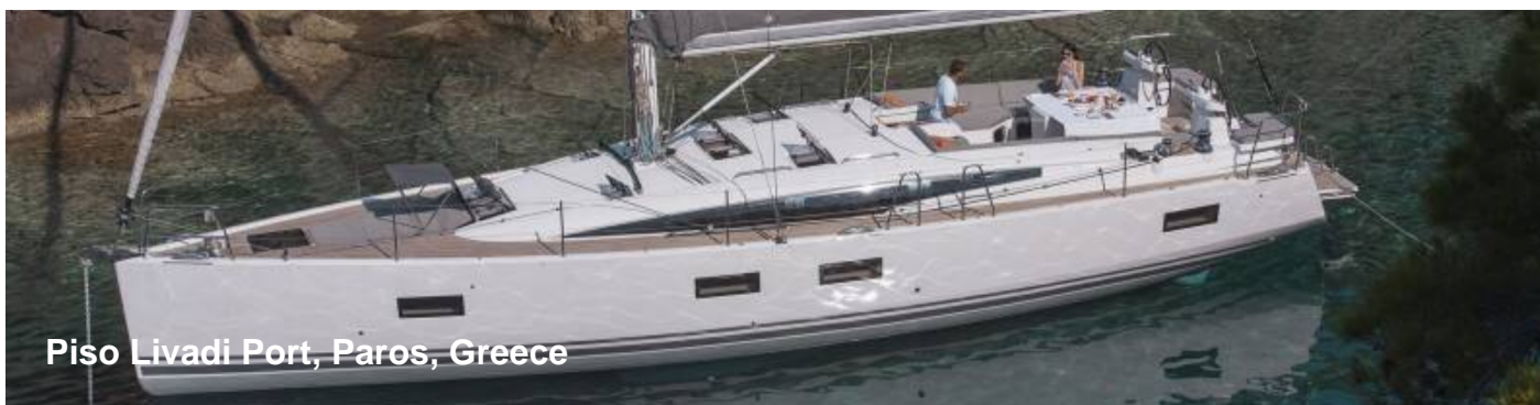
Piso Livadi Port, Paros, Greece