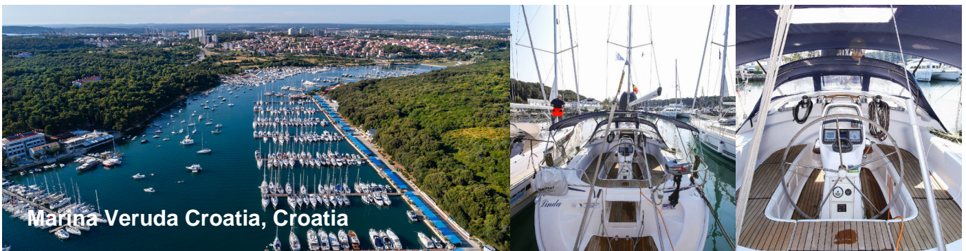
Marina Veruda Croatia, Croatia