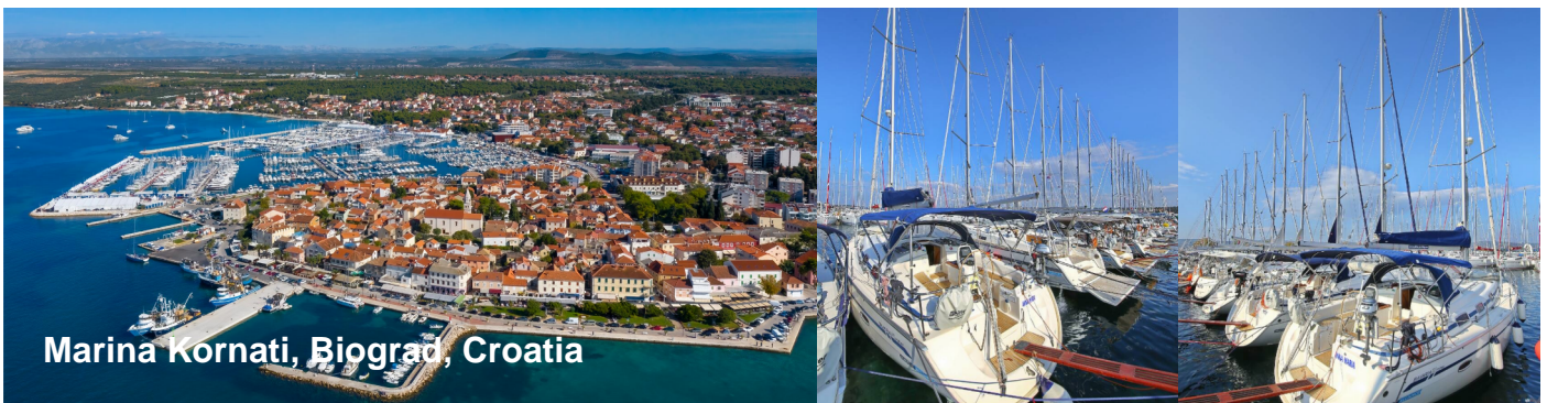
Marina Kornati, Biograd, Croatia