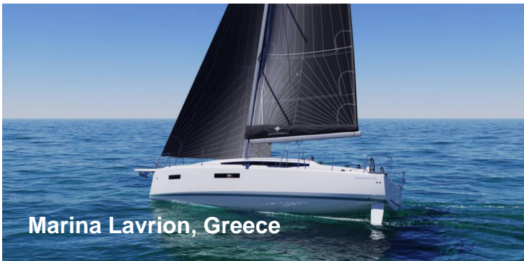
Marina Lavrion, Greece