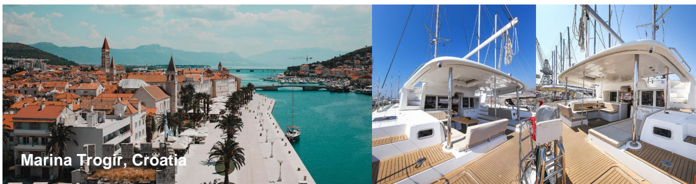
Marina Trogir, Croatia