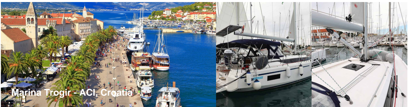
Marina Trogir - ACI, Croatia