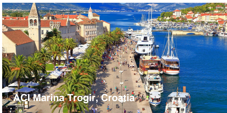
ACI Marina Trogir, Croatia