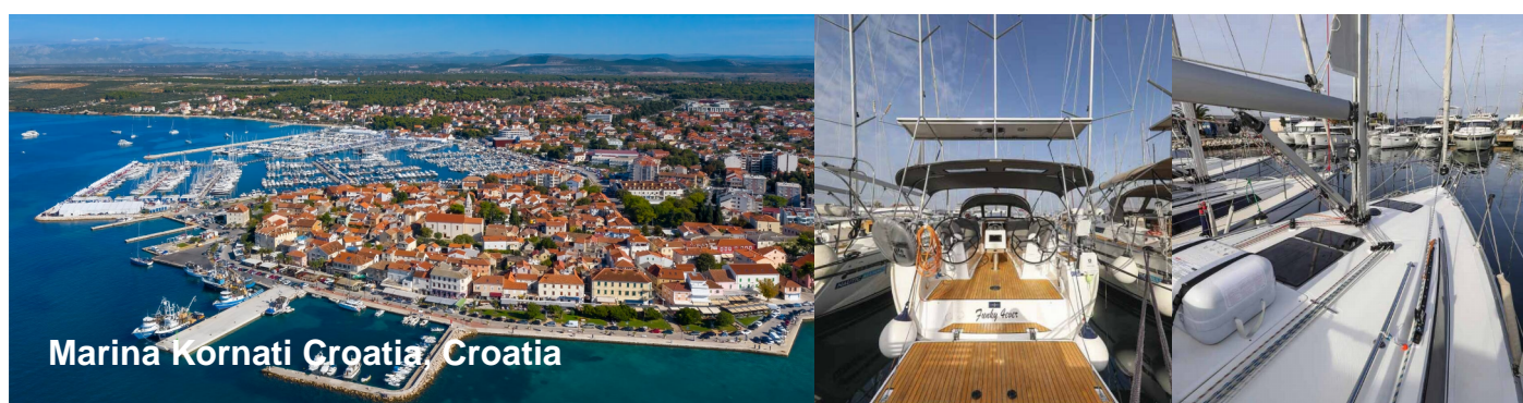
Marina Kornati Croatia Croatia