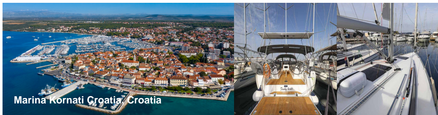
Marina Kornati Croatia Croatia