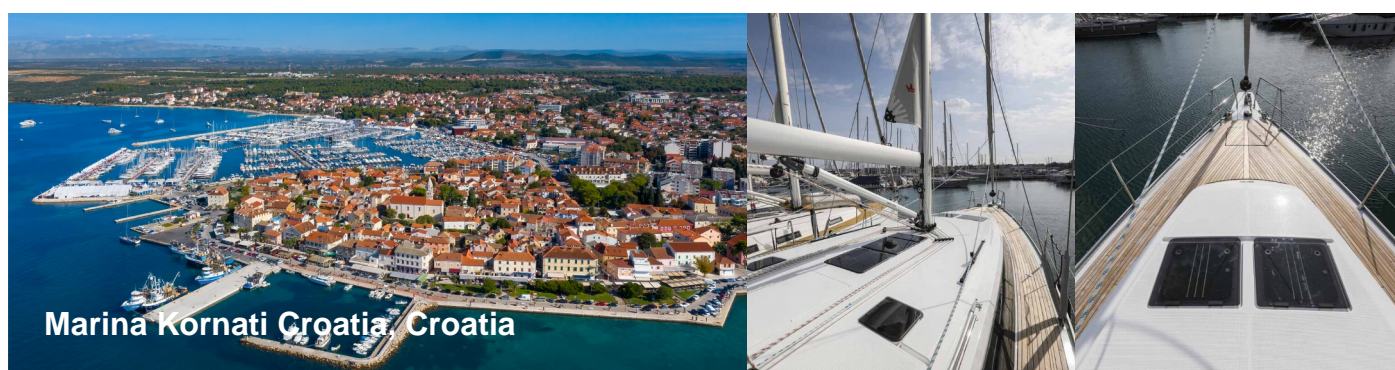
Marina Kornati Croatia Croatia