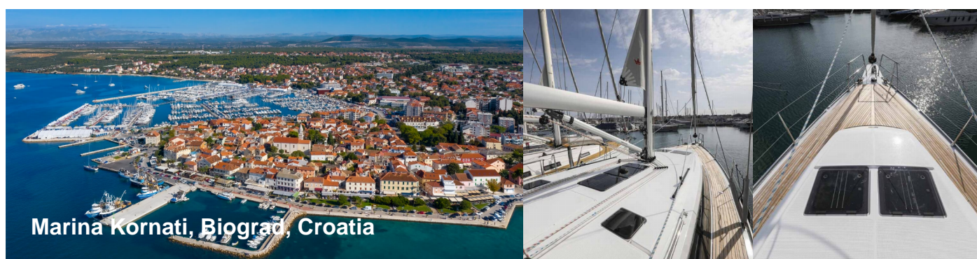
Marina Kornati, Biograd, Croatia