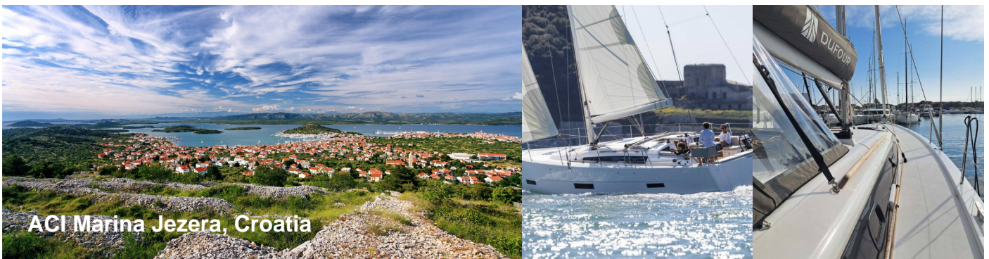
ACI Marina Jezera, Croatia