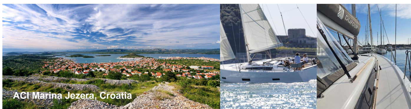
ACI Marina Jezera, Croatia