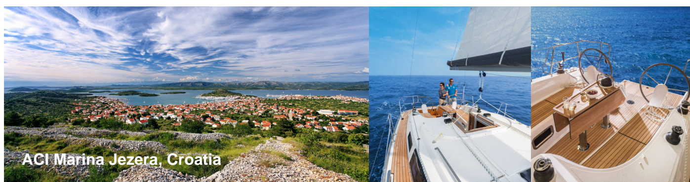
ACI Marina Jezera, Croatia