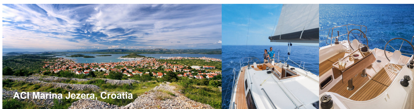
ACI Marina Jezera, Croatia