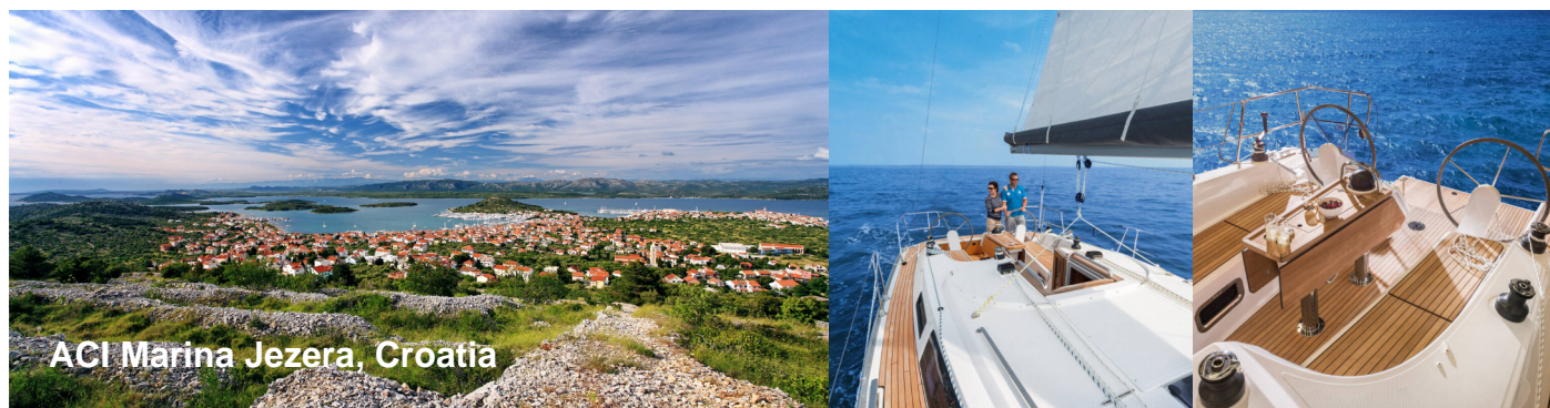
ACI Marina Jezera, Croatia