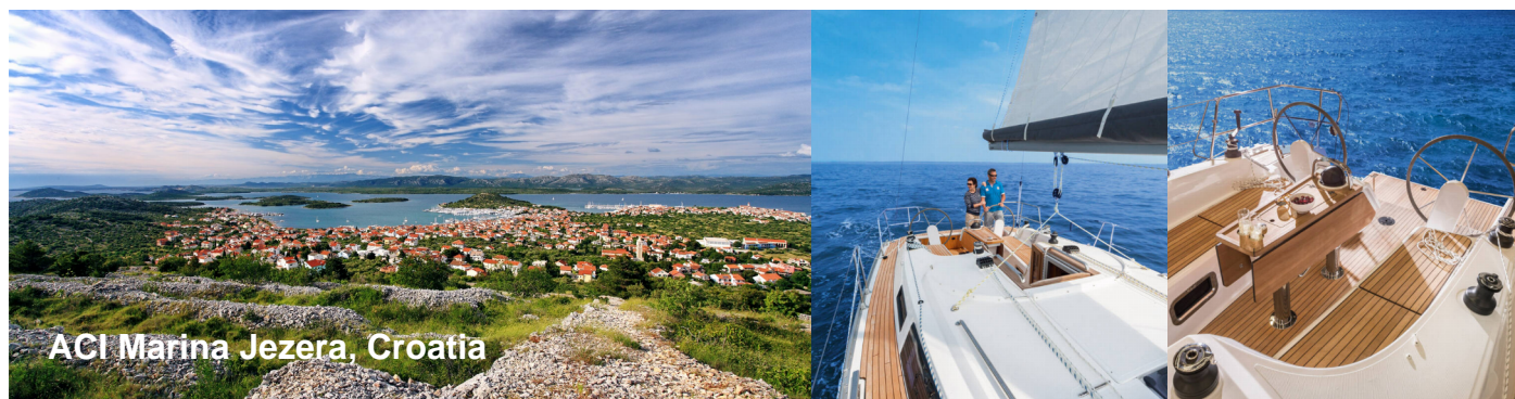
ACI Marina Jezera, Croatia