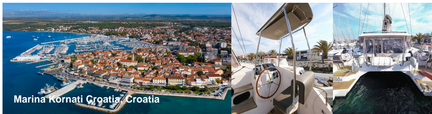
Marina Kornati Croatia Croatia