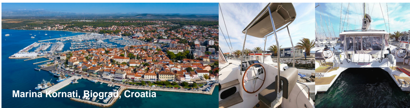
Marina Kornati, Biograd, Croatia