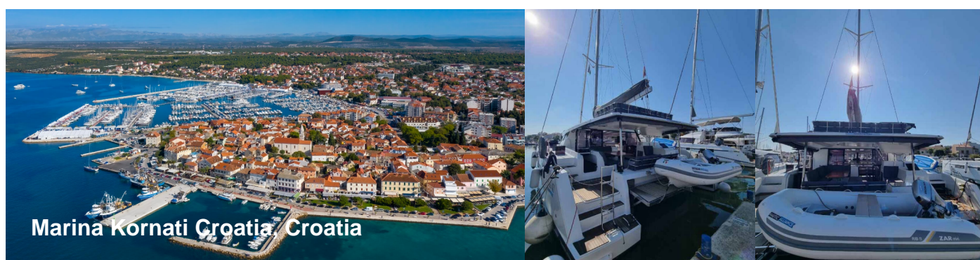
Marina Kornati Croatia Croatia