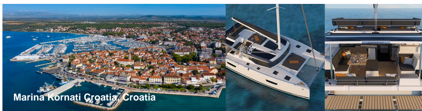
Marina Kornati Croatia Croatia