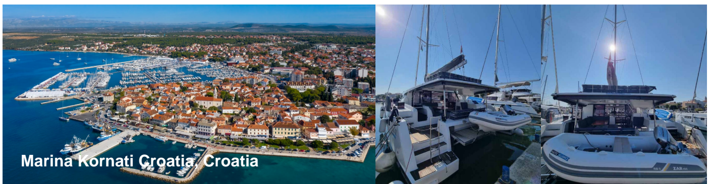
Marina Kornati Croatia Croatia