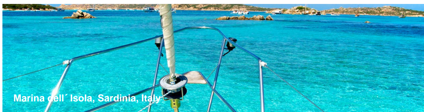
Marina dell'Isola, Sardinia, Italy