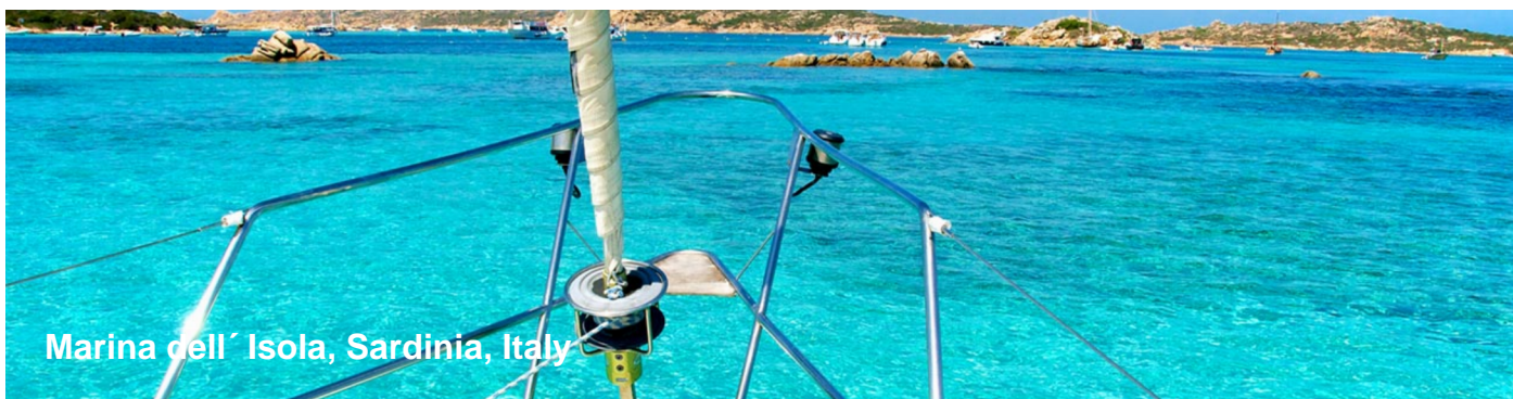
Marina dell'Isola, Sardinia, Italy