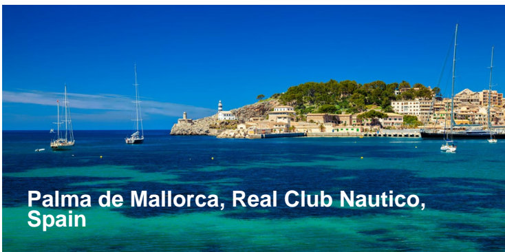
Palma de Mallorca, Real Club Nautico, Spain