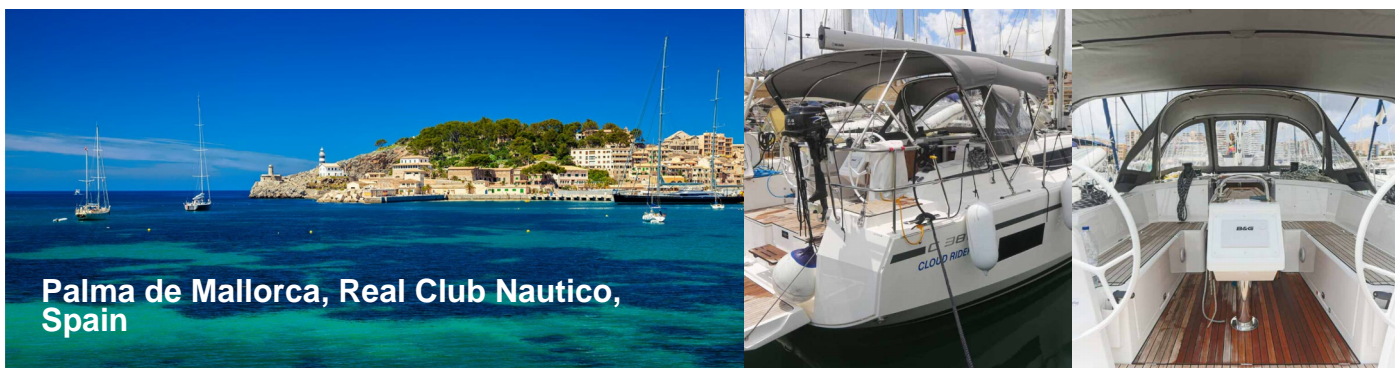
Palma de Mallorca, Real Club Nautico, Spain