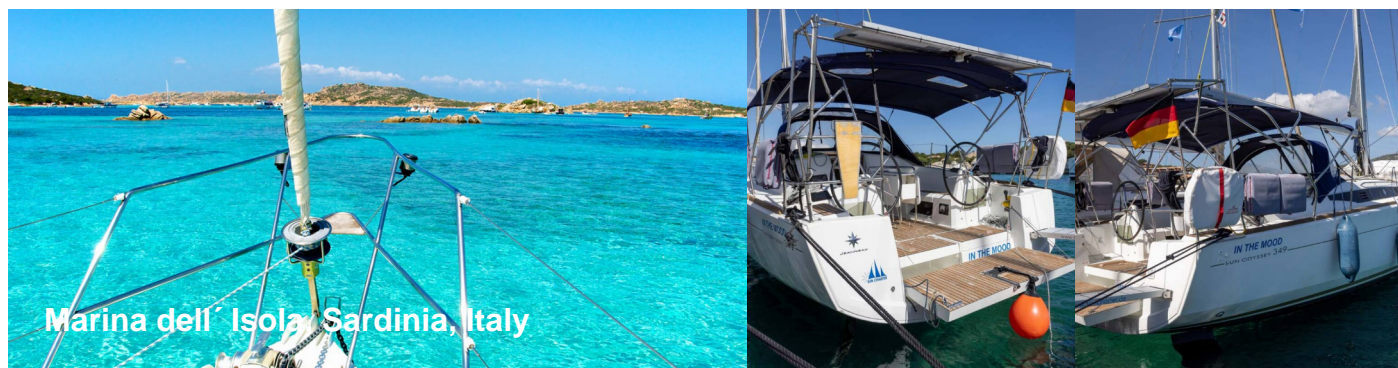
Marina dell' Isola Sardinia, Italy