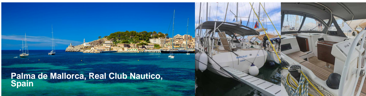
Palma de Mallorca, Real Club Nautico, Spain