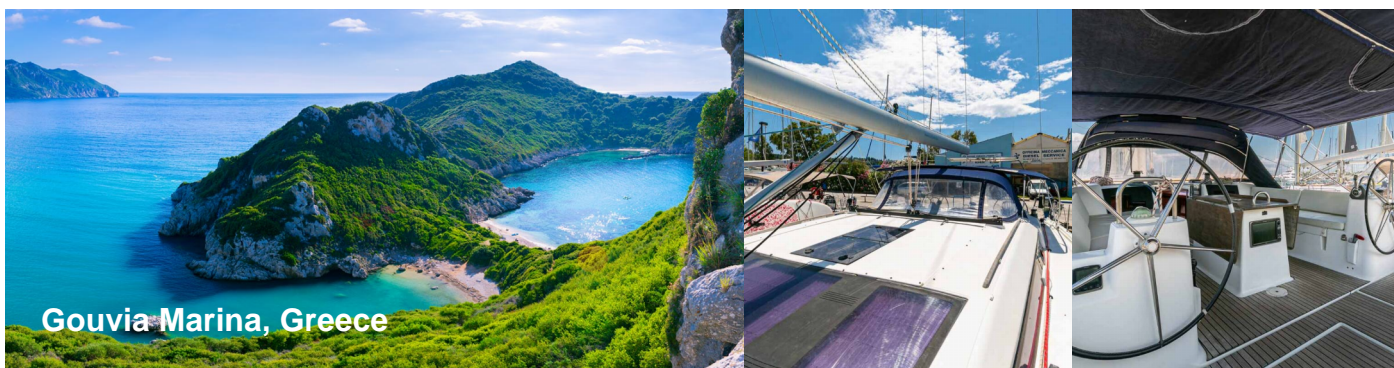
Gouvia Marina, Greece