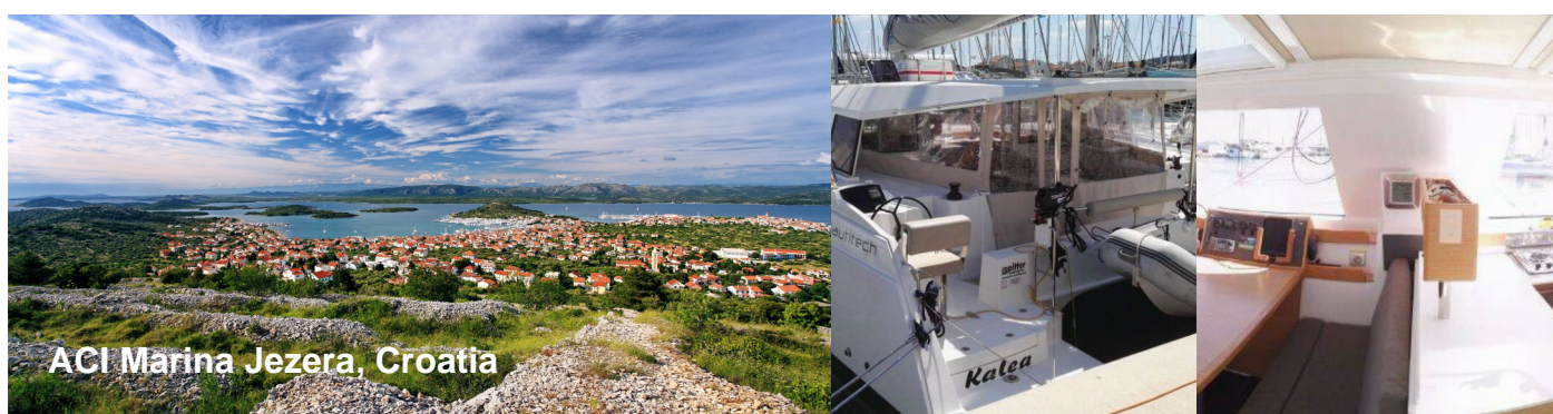
ACI Marina Jezera, Croatia