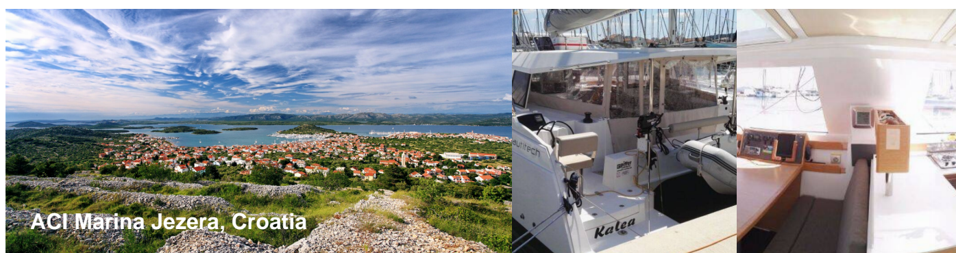
ACI Marina Jezera, Croatia