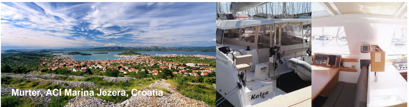
Murter, ACI Marina Jezera, Croatia