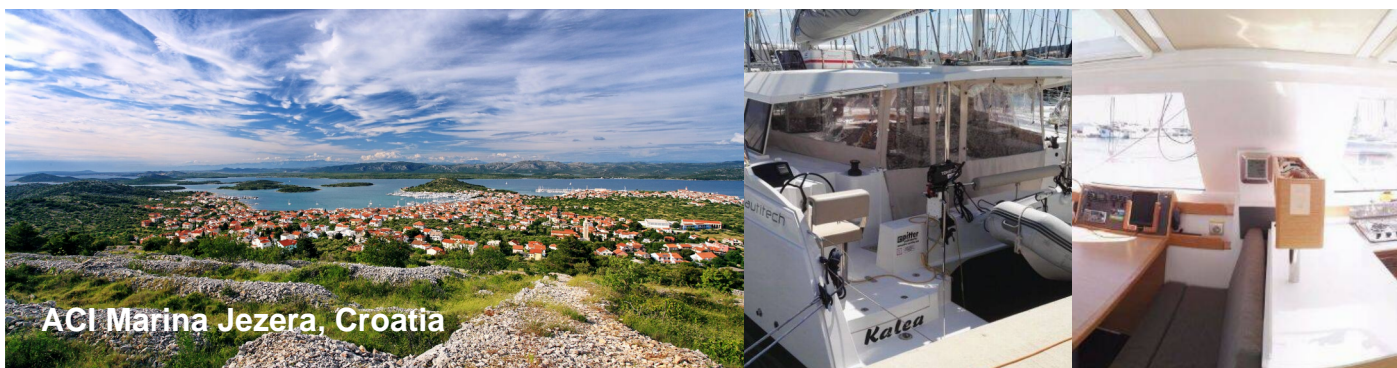
ACI Marina Jezera, Croatia