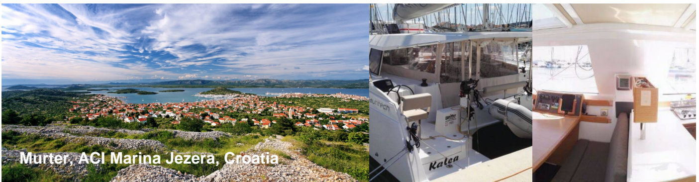
Murter, ACI Marina Jezera, Croatia