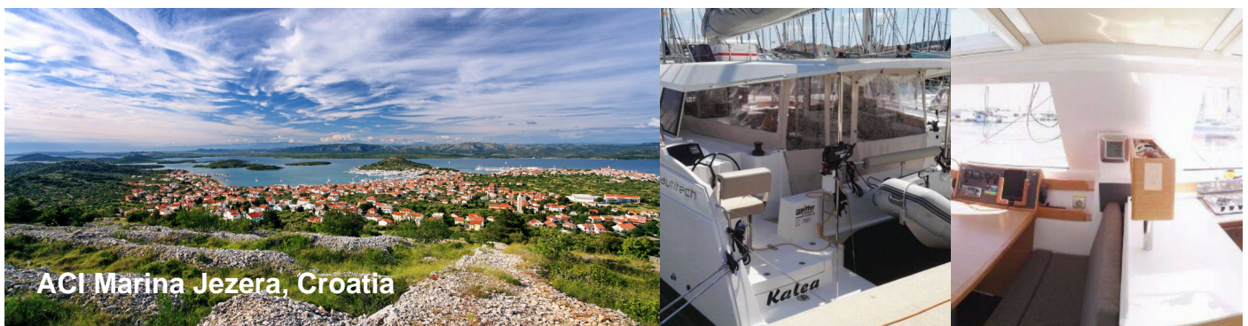
ACI Marina Jezera, Croatia