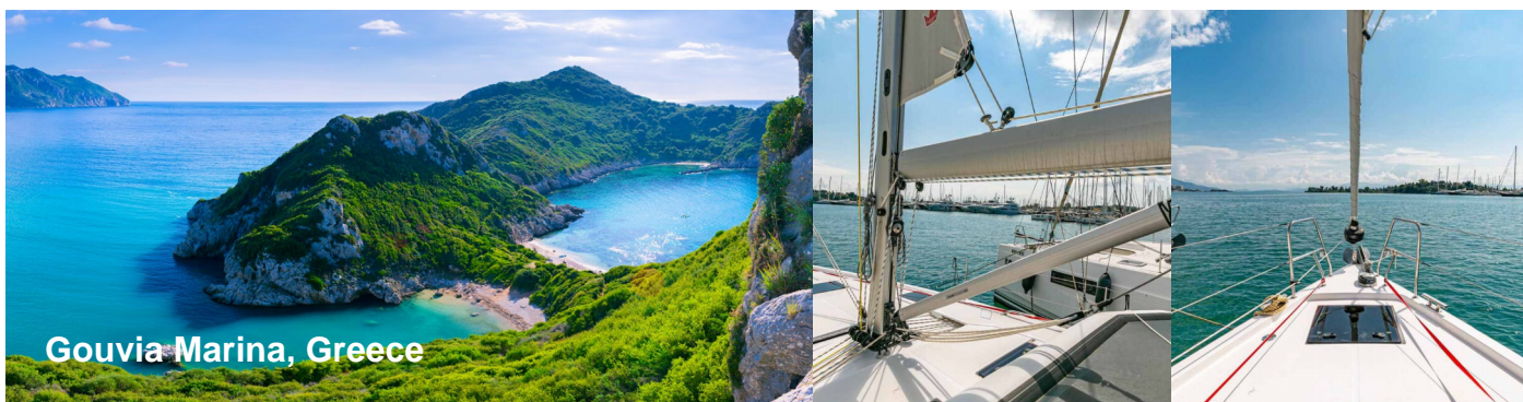
Gouvia Marina, Greece