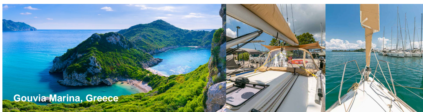
Gouvia Marina, Greece