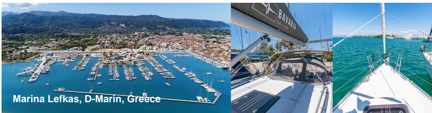
Marina Lefkas, D-Marin, Greece