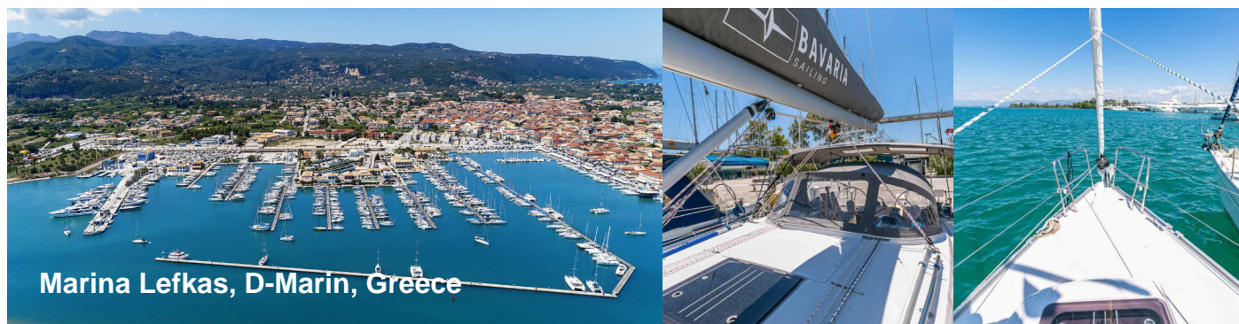
Marina Lefkas, D-Marin, Greece