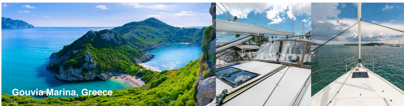
Gouvia Marina, Greece