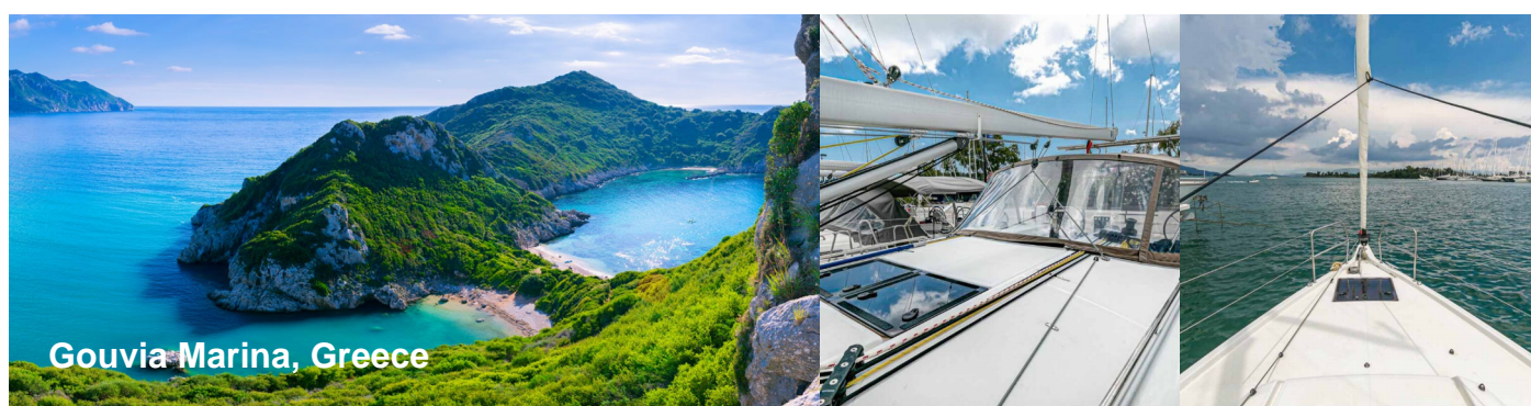
Gouvia Marina, Greece