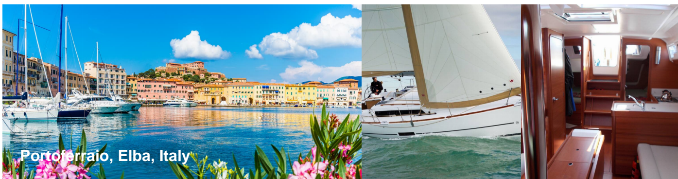
Portoferraio, Elba, Italy