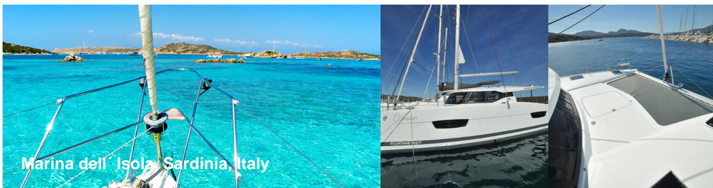
Marina dell' Isola Sardinia, Italy