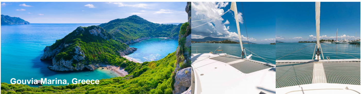
Gouvia Marina, Greece