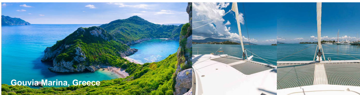
Gouvia Marina, Greece